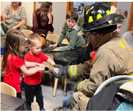
Vernon Co. Fire Department teaches fire safety

The Family & Child Development team is always looking for unique ways to provide Head Start and Early Head Start with resources needed to create valuable learning opportunities, such as fire and personal safety.