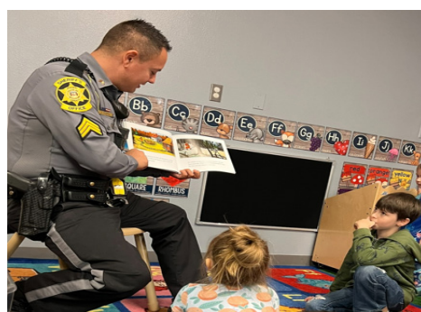
Vernon Co. Sheriff's Office shares awareness